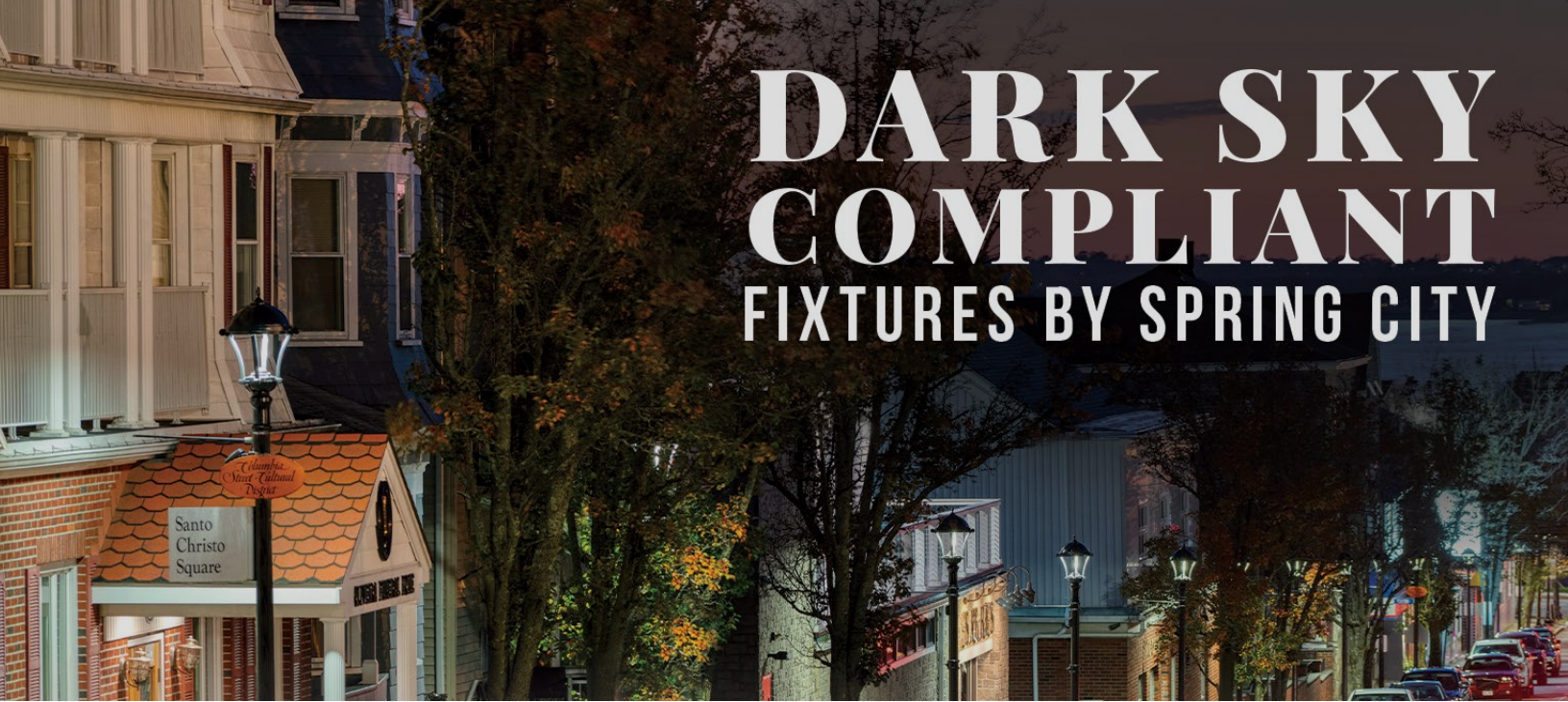
PICTURED ABOVE: RICHMOND