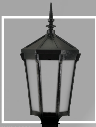
WILLIAM & MARY