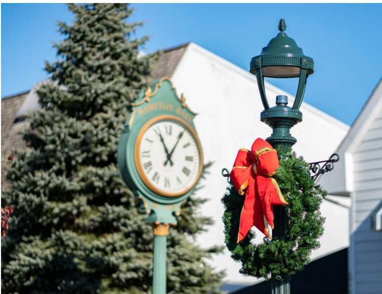
PICTURED ABOVE: AUGUSTA WITH WIRELESS NODE

The Dark Sky initiative aims to have a healthier and happier night environment by diminishing light pollution. Spring City's Dark Sky Compliant fixtures showcase the commitment to lowering light pollution while offering a unique range of aesthetically designed Dark Sky Compliant options. Beautifully crafted design married with environmental consciousness.