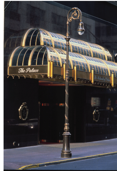
Bishop's Crook Ductile Iron Lamp Post

Spring City is confident that our ductile iron lamp posts and base covers will last the lifetime of your project. Our ductile iron products are virtually indestructible and have been known to survive some of the most extreme moments in American history. If you choose to buy Spring City's ductile iron lamp posts or base covers for steel shafts, you will be investing your money in a quality product that will look new for many years to come! This comprehensive warranty covers the products mentioned above to be free from defects in material and workmanship under normal use and operation for twenty-five years (AASHTO minimum design life for luminaire support structure less than fifteen meters.) Damage from vehicles is included within the terms of normal use. This warranty is subject to the conditions and limitations listed below.